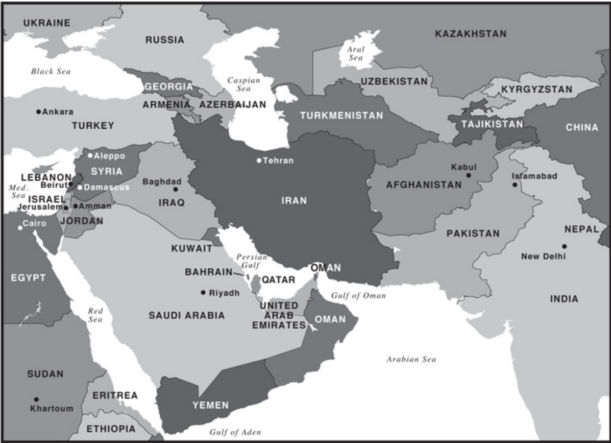
Map 1 The Middle East, Southwest and Central Asia