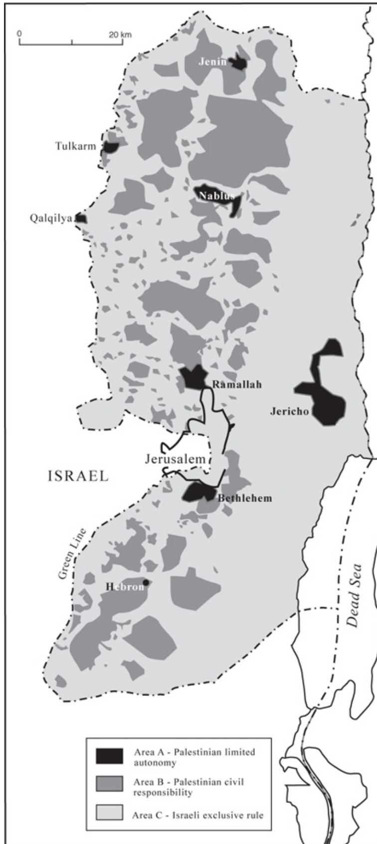
Map adapted from PASSIA, 2002