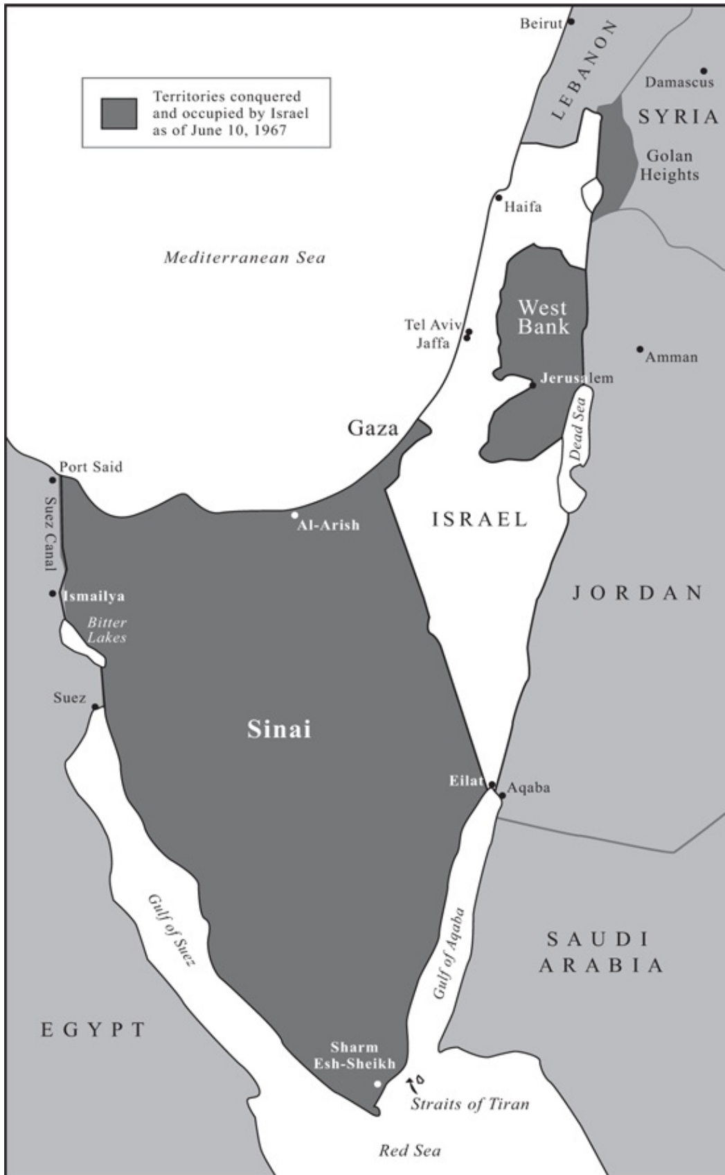
Map adapted from PASSIA, 2002