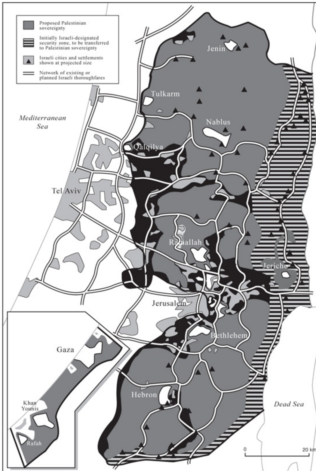
Map adapted from PASSIA / © Jan de Jong, 2001